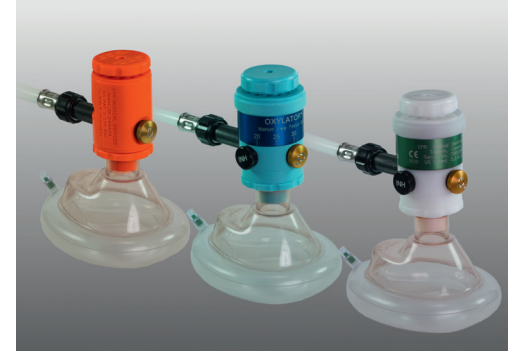
Oxylator FR-300, EMX and HD (l.t.r.)

The Oxylator will not start a new inspiratory cycle until exhalation is complete. That point is reached between 2–4 cmH<sub>2</sub>O of PEEP in automatic or continuous mode, and at baseline in manual mode. This eliminates "stacked" breaths and their associated complications. The end of the expiratory phase then triggers the next inspiratory cycle, hence the new inspiratory phase is flow triggered.